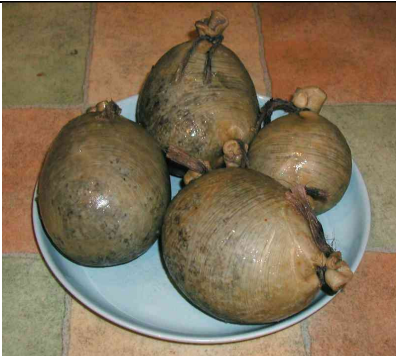
Haggis is a traditional Scottish dish made from the liver, heart and lungs of a sheep, all chopped, mixed and stuffed into the stomach of a sheep.